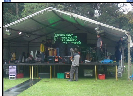
The Screen in use

Marius has offered to visit churches, schools or events to help spread the word about these ministries and also to just Praise God with amazing worship. If you'd like him to visit your church feel free to contact him.