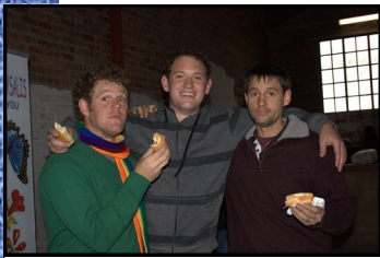
Some of the lads.